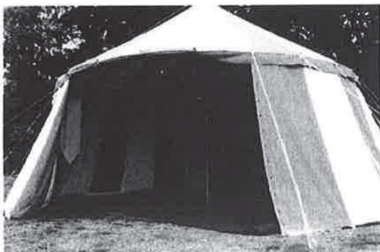
Grand Round Pavilion on its own